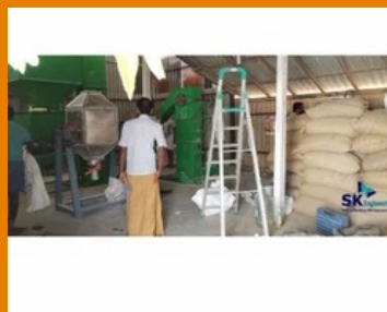
5 KPH Cattle Feed Maze Machine