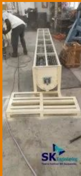
Stainless Steel Screw Conveyor