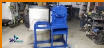
Pulverizer Hammer Mill