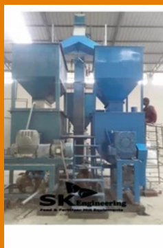
Poultry Feed Making Machine