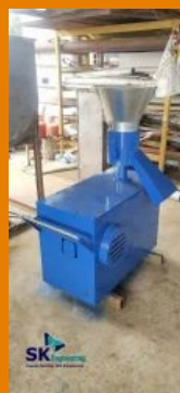
Poultry Feed Pellet Making Machine