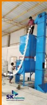
1 Ton Feed Lifting Elevator