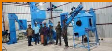
Cattle Feed Pellet Mill Machine