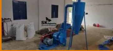
Feed Hammer Mill