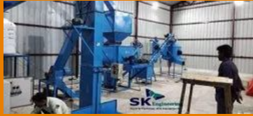
0.5 TPH Cattle Feed Unit