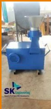
Mini Poultry Cattle Feed Pellet Machine