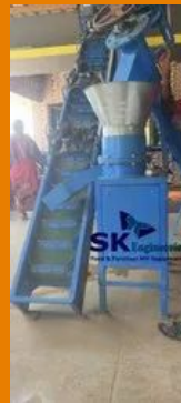
Feed Belt Conveyor