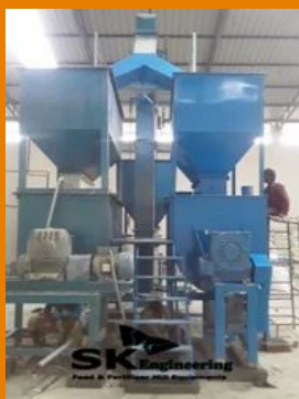
20 HP Poultry Feed Making Machine