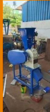
500 KPH Mild Steel Pulverizer Machine