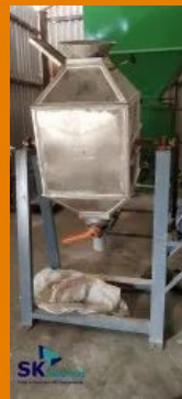
Medicine Mixing Machine