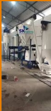
Poultry Cattle Pellet Feed Making Machine