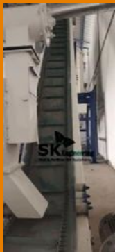
MS Flat Belt Conveyor