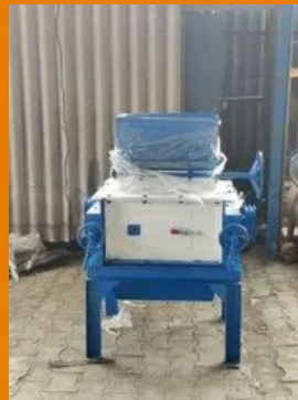
300 KPH Feed Crumpler Machine