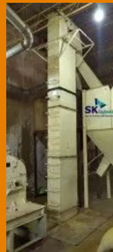
2Hp Feed bucket Elevator