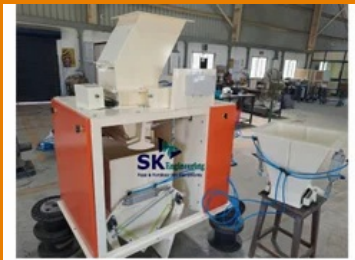
250 KPH Auto Packing Machine