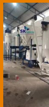
Cattle Feed Pellet Making Machine