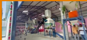
2000 KPH Cattle Feed Making Machine