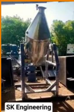
Animal Feed Medicine Mixer Machine