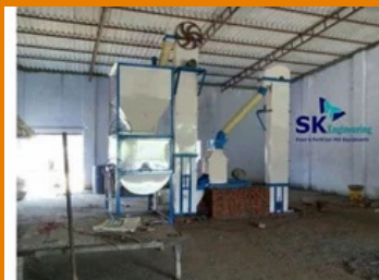
3000 KPH Poultry Feed Plant