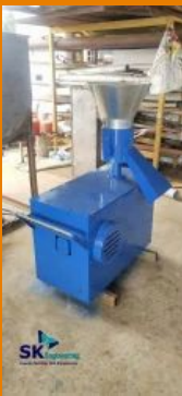
Poultry Bird Feed Making Machine